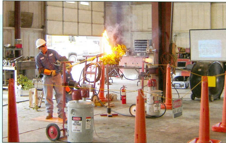
Tri-County Electric made their point on observing extreme caution in dealing with power lines with the Grand-Finale Arcing Demonstration.